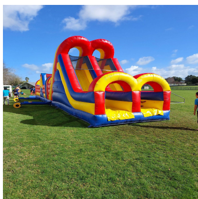
The 50ft Obstacle

Here are a few photographs of the tamariki in action.