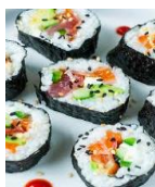
sushi taakai raihi