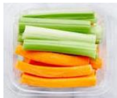
carrots and celery raakau kaaroti

Here are some healthy options for lunchboxes: