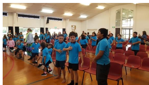
Members of the Kura Rumaki and Junior school sing a song and haka to say thank you