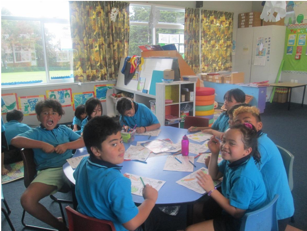
Ngaa mihi mo ou awahi Tirairaka